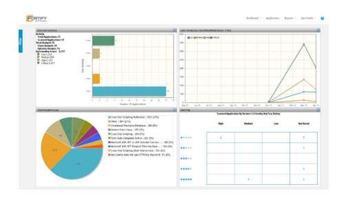
Figure 2. Detailed reporting: Fortify on Demand reporting can correlate the results from different forms of testing and prioritize them by severity to present the truest representation of application risk.screenshot named fod detailed reporting